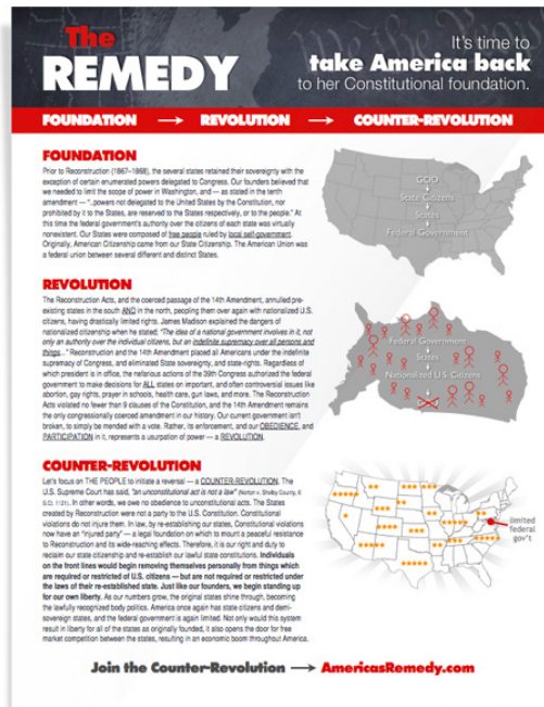
The REMEDY Flyer